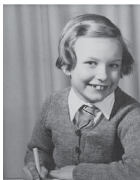
1 Well perhaps a little older than this!

This is not an exhaustive list of the Cluster's achievements, too many to mention in this short article, but I hope it conveys the message that, as with most things in life, it is the people that are the most important component. It has been a wonderful nine years and one of the best roles I will ever have. I look forward to watching the Bio21 Cluster go from strength to strength in the future 3 .