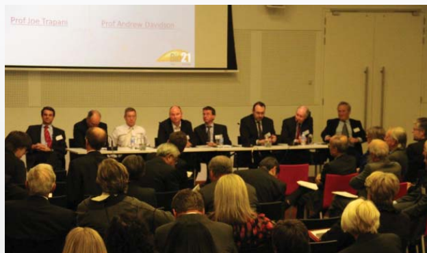
One of the many lively panel discussions followed by Q & A and enthusiastic audience participation.