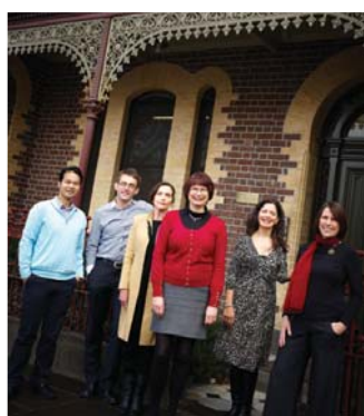
2 The team in 2010 outside our Barry Street offices